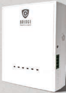
CKB-304 4 Channel Bridge