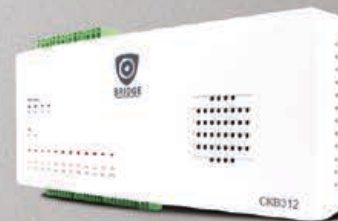
CKB-312 12 Channel Bridge