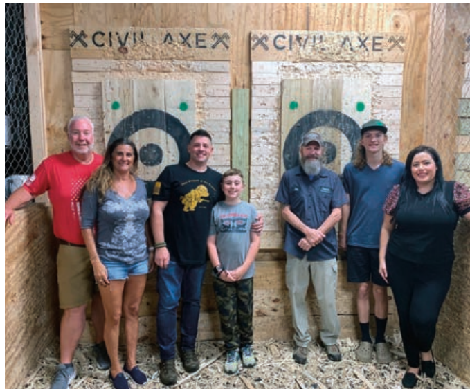
The Axe Throwing competition saw all age groups.