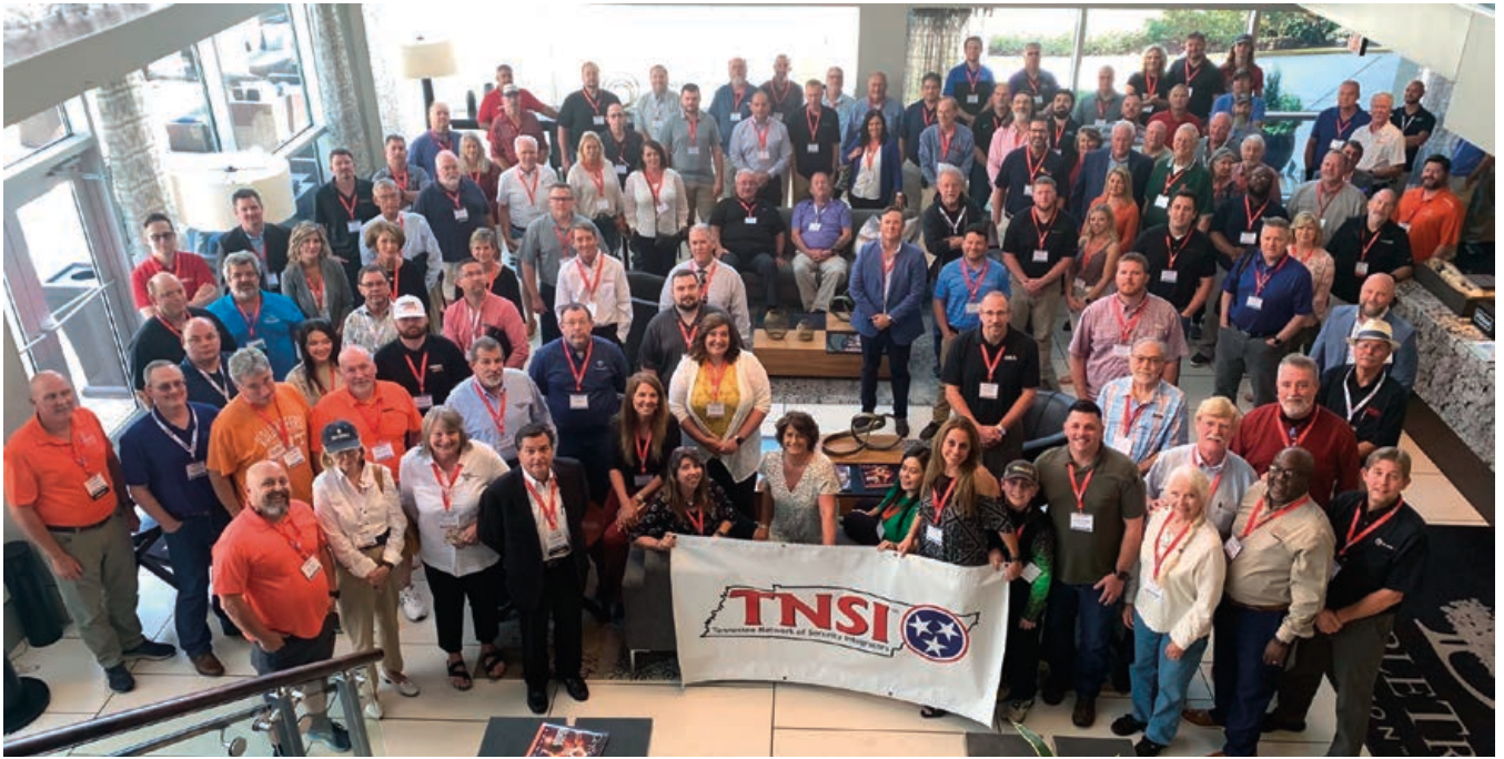
TNSI's Convention was a success in numbers.