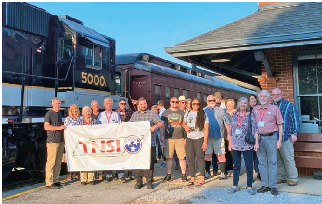
The group of attendees for the Dinner Train event posed together before the "All Aboard!"