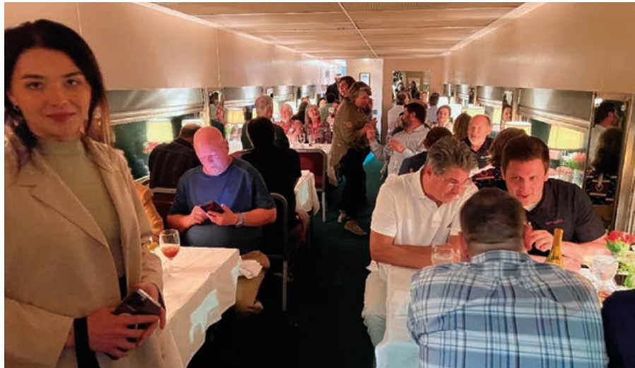
The Dinner Train event was the perfect night cap to another successful convention.