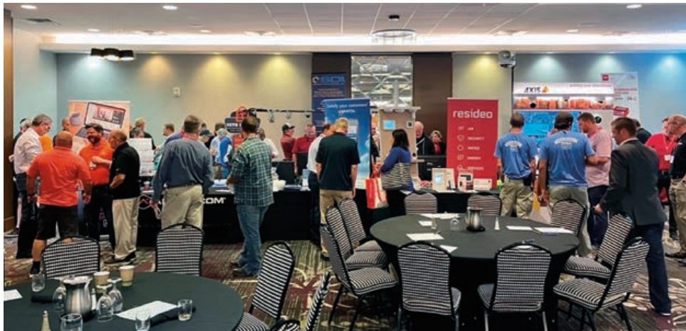
The exhibits showed the latest technology and trends available in the TN market.