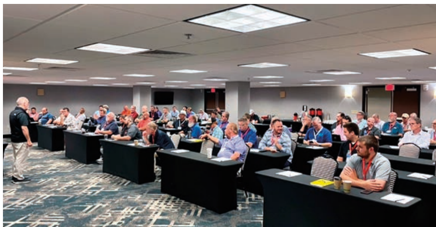
A key part of TNSI's Convention was the training for CEU's.