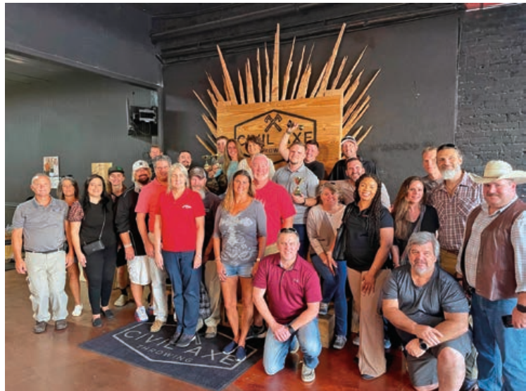
TNSI's Axe Throwing event participants share a group photo.