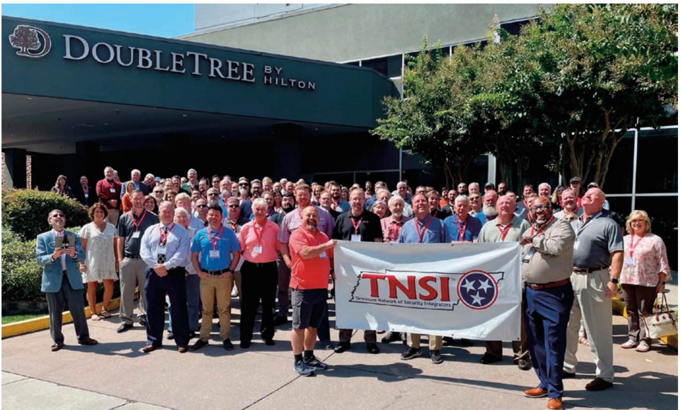
A large turnout gathered for TNSI's 42nd Annual Convention outside the main venue, the DoubleTree Hotel in Chattanooga, TN.

Tennessee Convention, continued on page 6 (Photos beginning on page 18)