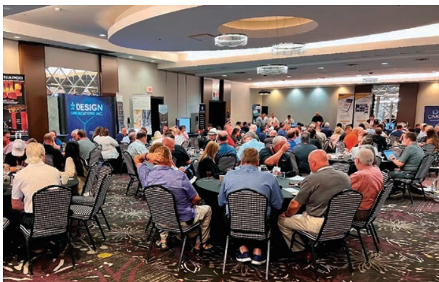
One of several well-attended seminars.