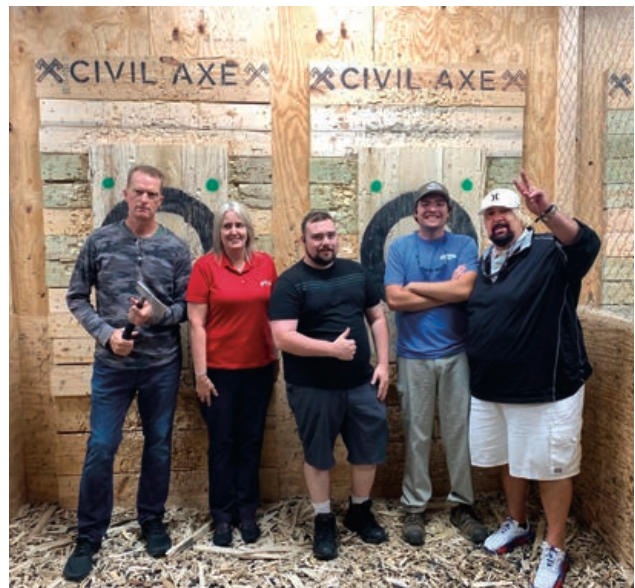
A group of happy participants was evident at the axe throwing event.